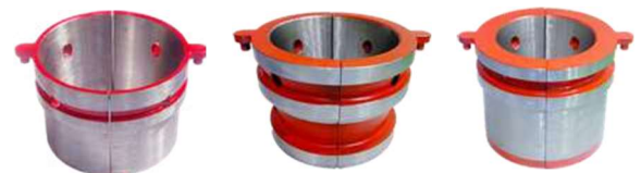
Insert Bowl No. 1 Insert Bowl No. 2 Insert Bowl No. 3 (Suitable for above all three models of Master Bushing) Figure No. 4