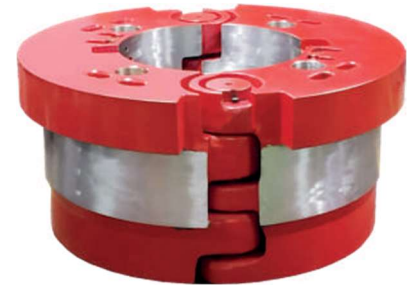
Model: ABMB 3750-E (For EMSCO) Figure No. 3