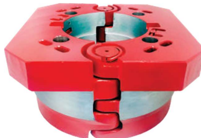
Model: ABMB 3750-SQ (For Oilwell) Figure No. 2