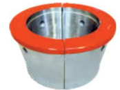
Casing Bowl No. 1