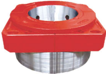
For 27 1/2" Rotary Table Figure No. 12

Different sizes of Insert Bowls can also be used in these bushings to lower different sizes of casing pipes.