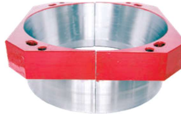
For 37 1/2"-49 1/2" Oilwell Rotary Table Figure No. 13