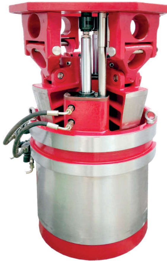
Model : ABHPS-27